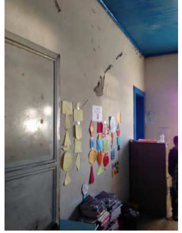
Figure 32 – Shear cracking in wall panels