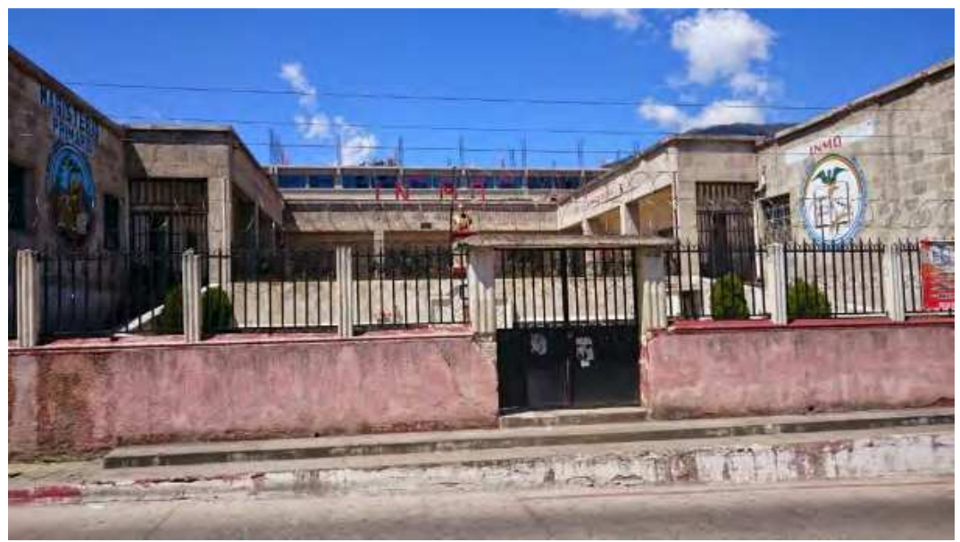
Figure 16 – Front of INMO – one story partially confined buildings

There are three main structure types at the INMO school. The school site is gently sloped, with about a one-story height difference from one side of the campus to the other. There are one-story unreinforced or partially confined older buildings (Figure 16), a three-story confined masonry structure (Figure 17) and a new two-story confined masonry building (Figure 18). The older portion of the build also houses a two-story tall auditorium space (Figure 19). The one-story structures typically have light-weight roofs. The two and three story structures have concrete slab roofs.