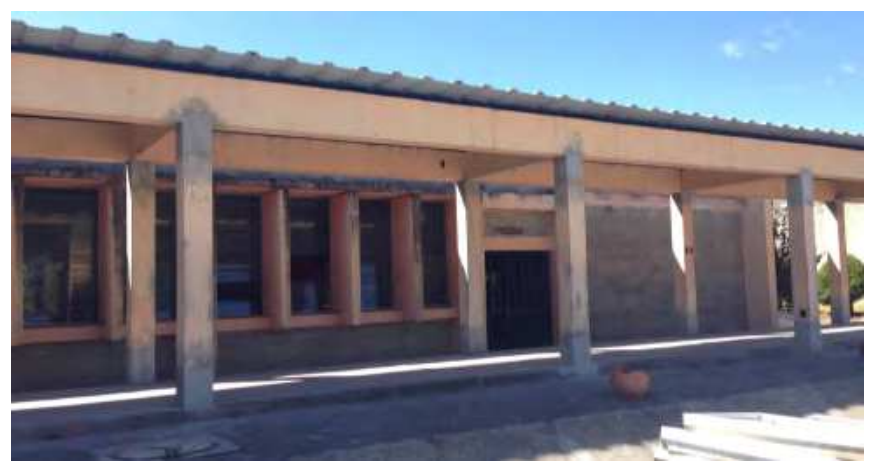
Figure 3 – School Building with covered walkway in front