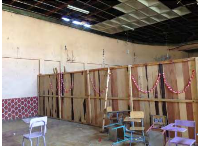
Figure 19 – Auditorium space