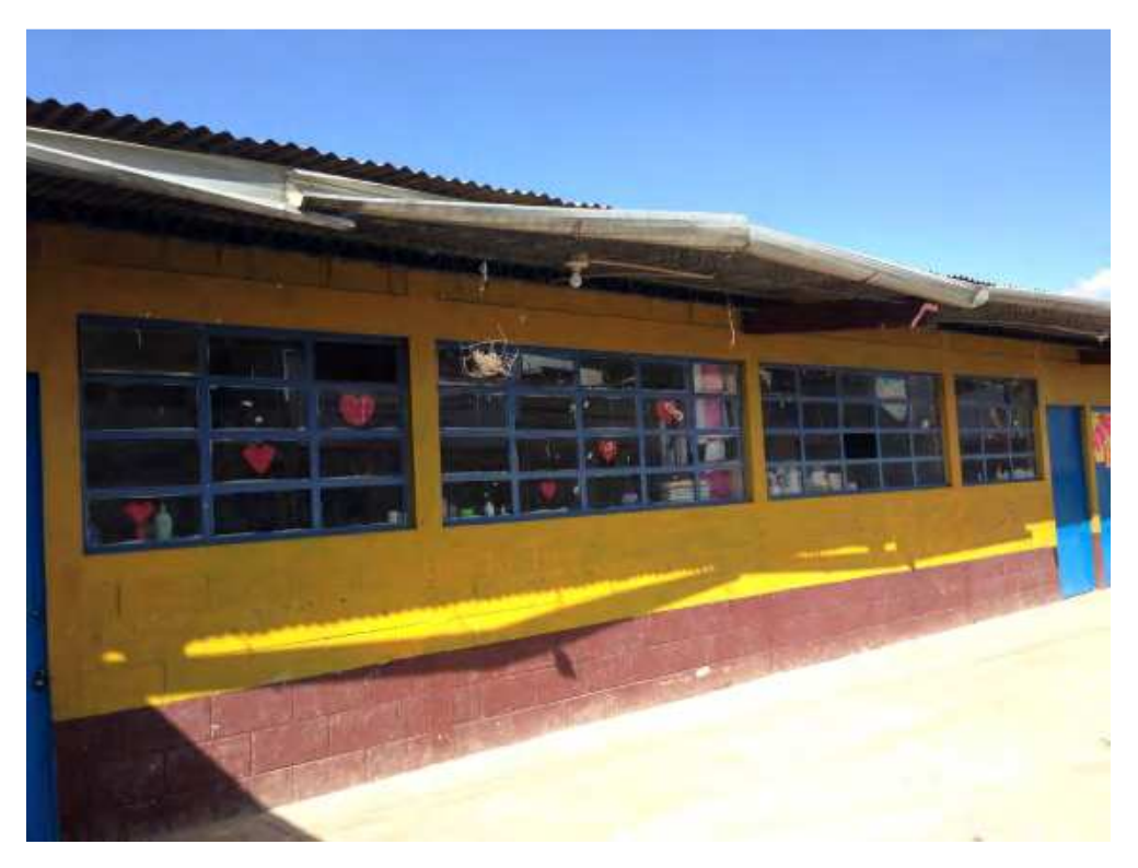
Figure 38 – Interior longitudinal wall elevation

• Excessive distance between cross walls – This can lead to overstressing the parallel cross walls that do exist as well as lead to premature out-of-plane failures in perpendicular walls where there are light-weight roofs.