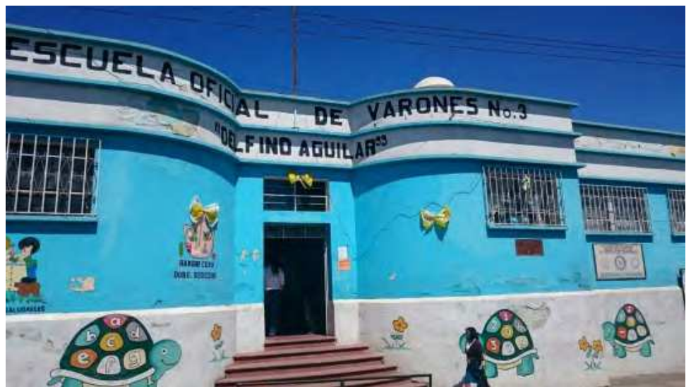
Figure 26 – Front of school

The building is single-story and U-shaped around a central courtyard (Figure 26 and 27). There is a taller portion at the front of the building (Figure 28). The building has a concrete roof at the entrance, and light-weight roof at the classroom wings. The walls appeared to be partially confined brick masonry walls. The site is essentially flat.