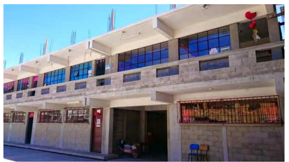
Figure 18 – New two-story confined masonry building