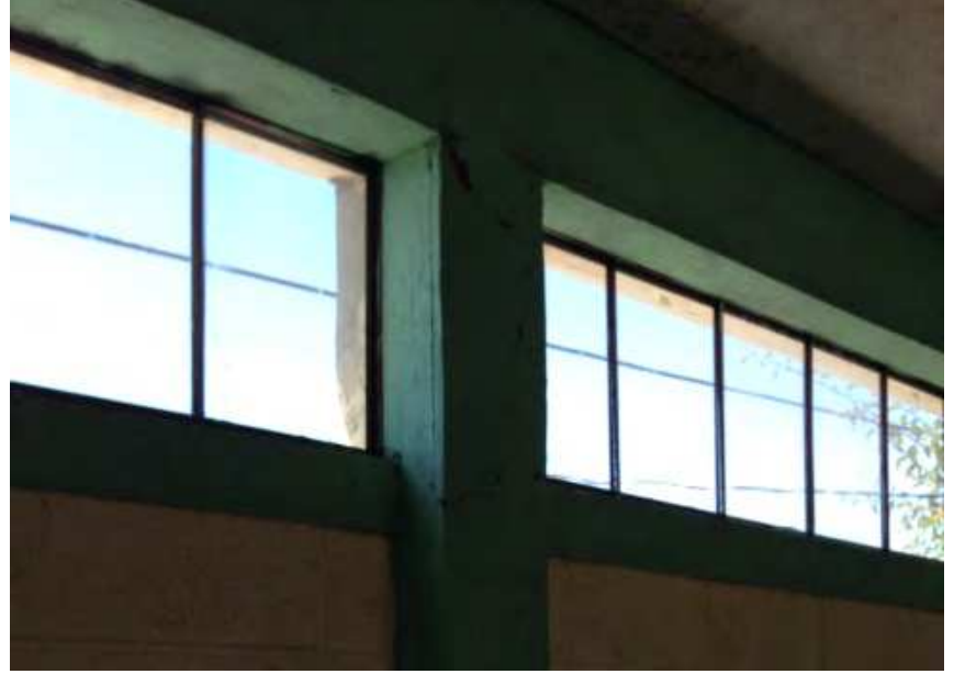
Figure 23 – Short column shear failure damage