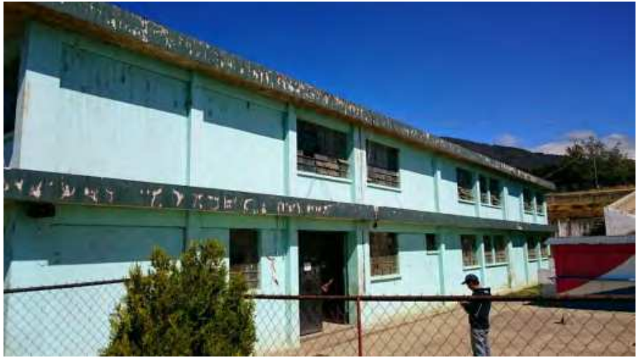
Figure 9 – Concrete moment frame building

The school is located on a gently sloping site. It consists of three independent two-story reinforced concrete frames with masonry infill buildings (Figure 9) and one two-story confined masonry building (Figure 10). The concrete frame buildings are arranged in a U-shape around central courtyard and have a small seismic gap separation between each other (Figure 11). There also appeared to be a foam material around the perimeter and separating the infill panels from the frame structure. These buildings have concrete slab roofs. The confined masonry building has a light weight roof framed with shallow steel trusses. The stair bay at one end appeared to be an independent adjacent structure.