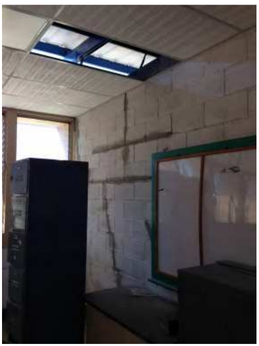
Figure 4 – Repaired wall cracks

In several buildings, the existing walls showed signs of shear cracking in the earthquakes. In most cases, these cracks had been repaired (Figure 4) or the wall had been rebuilt. Some buildings had experienced roof failures, and were in various states of repair (Figure 5).