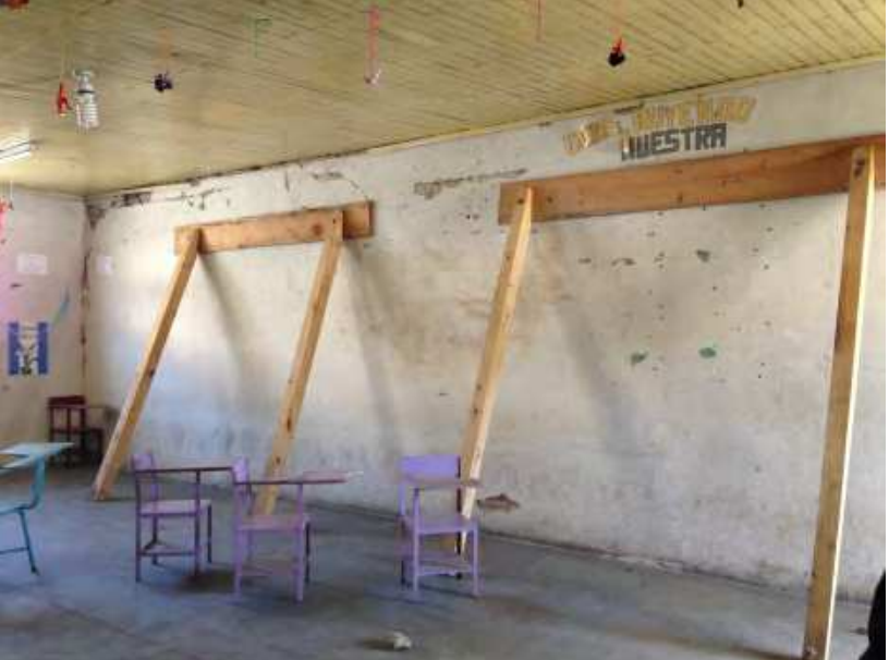
Figure 21 – Unreinforced masonry wall out-of-plane failure