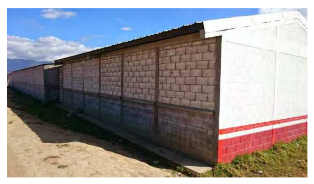
Figure 37 – Masonry infill at damaged classroom windows