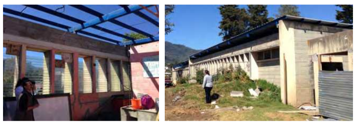
Figure 5 - Typical Longitudinal Wall and Elevation at the Classrooms

• Lack of longitudinal shear walls – The longitudinal classroom walls consisted primarily of window openings which reduces the lateral strength and stiffness of the building in the longitudinal direction (Figures 5 and 6). In some buildings a solid wall panel was provided at the end of the longitudinal wall elevation (Figure 3) but in other buildings it was not.