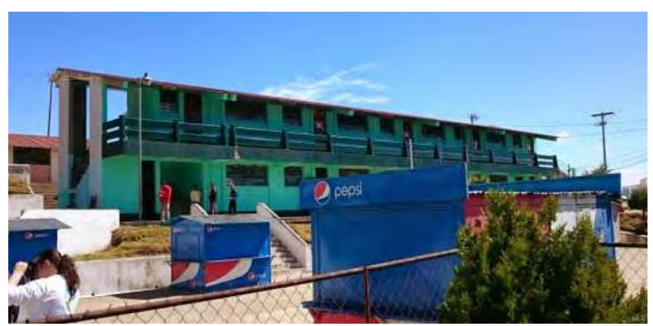
Figure 10 – Confined masonry building