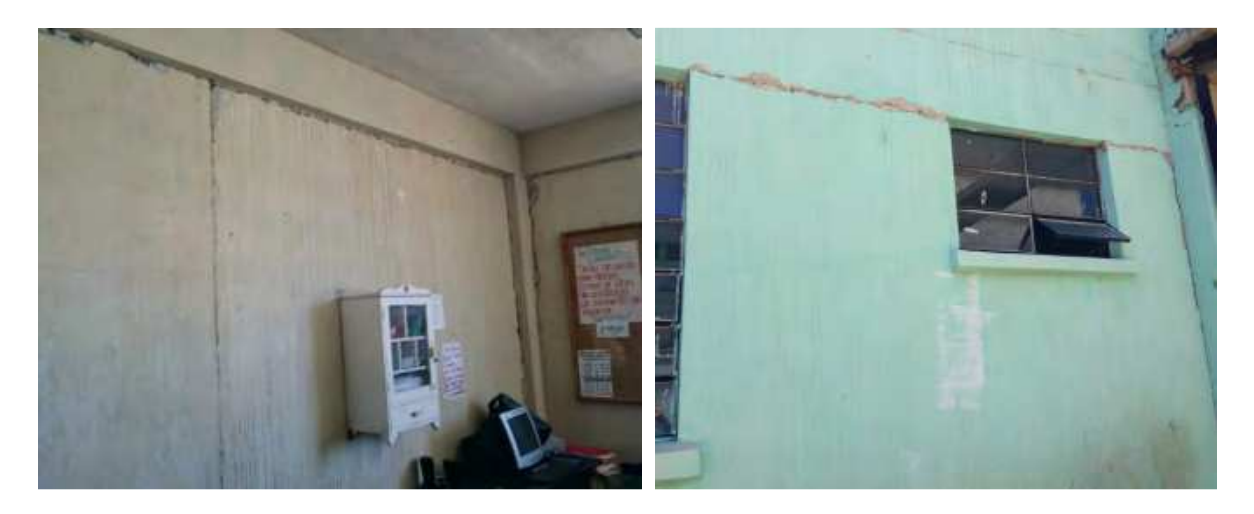
Figure 12 – Cracking around infill panel perimeter at interface with concrete frame at interior (left) and exterior (right)

The confined masonry building had been repaired and appeared to have thicker wall piers between windows. The reinforced concrete frame buildings were still in their damaged state. According to the school principal, the first earthquake caused cracking at the infill panel edges (Figure 12) and the subsequent earthquake led to some cracking in beams and columns (Figure 13). In some cases, the cracking around the panel edges is significant and could lead to out-of-plane failures of the wall panel in future shaking.