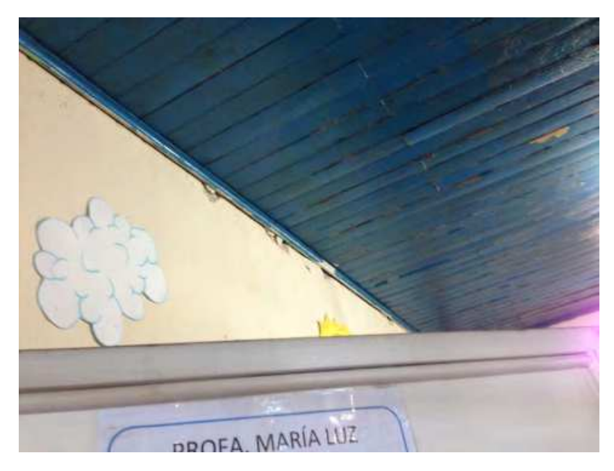
Figure 31 – Cracking at the top of walls (where wall and ceiling pulled apart)