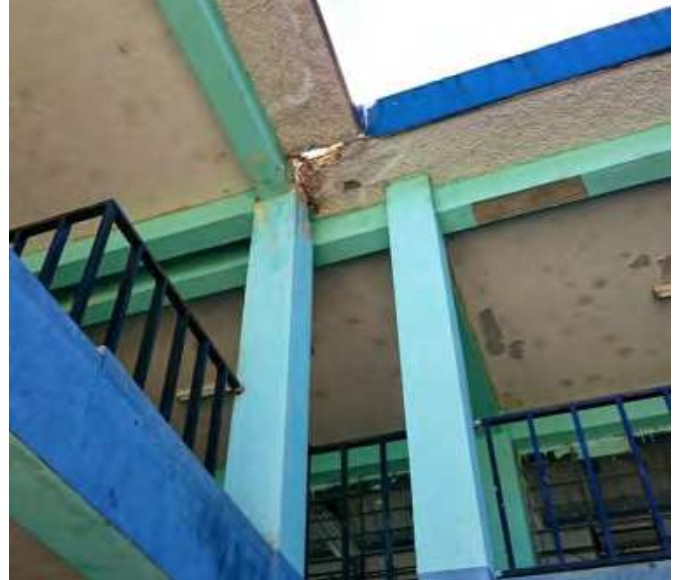
Figure 15 – Evidence of pounding