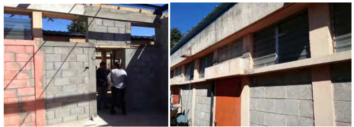
Figure 7 – Repaired short pier above door (left) and existing pier (right)

Walkway canopy - There are structurally independent walkway canopy structures composed of reinforced concrete moment frames (Figure 8). These structures failed at the top and bottom of the columns. Repairs have been made, but strengthening or the addition of bracing to prevent future failure in the same way has not been performed, so it is reasonable to expect similar or likely worse, performance in future earthquakes.