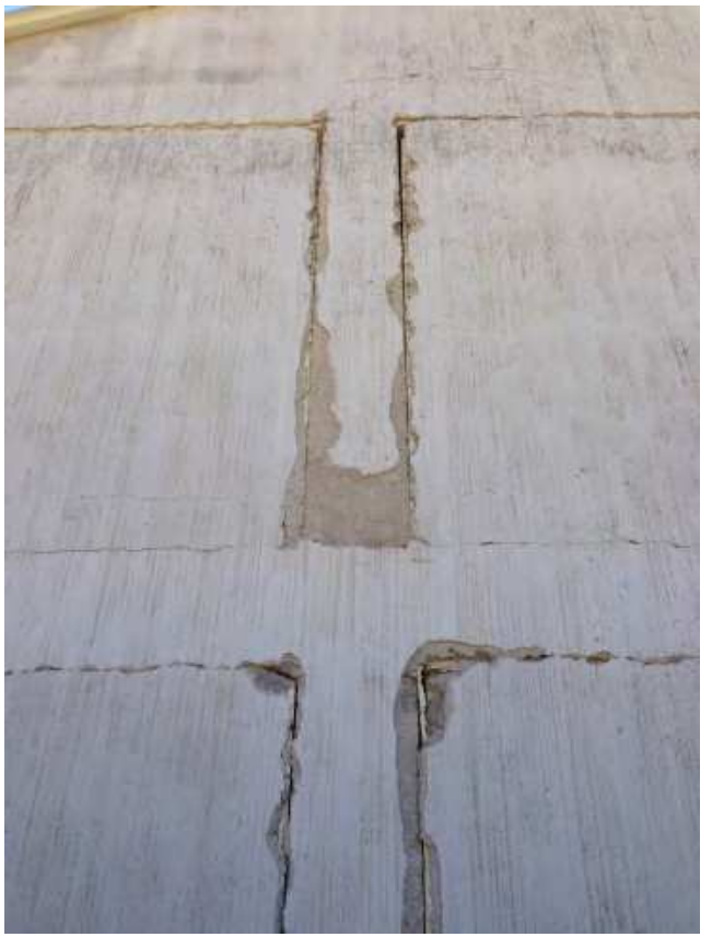
Figure 14 – Significant panel edge cracking

Some pounding damage was observed due to the interaction of the buildings at the seismic joints (Figure 15). The pounding appeared to cause only localized damage at the building roof and slab.