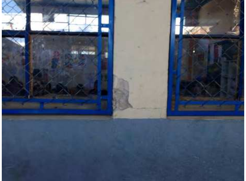
Figure 30 – Cracking at column base at window sill