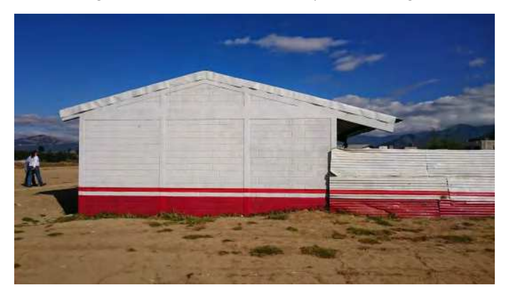
Figure 35 – Confined masonry gable end wall