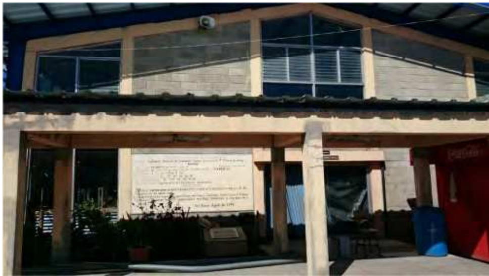
Figure 2 – Administrative two-story building

The school is located on flat land. It consists of multiple independent confined masonry buildings. The administration building is two-stories tall (Figure 2) and the classroom buildings are one-story (Figure 3). The roofs are composed of light-gage steel tubes or channels with corrugated metal roofing. There is a reinforced canopy structure covering the walkways between buildings; this is shown in both Figures 2 and 3.