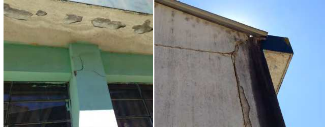
Figure 13 – Column-to-beam joint damage