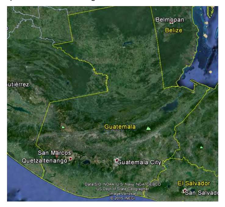
Figure 1 – Map of Guatemala with San Marcos and Quetzaltenango

This report summarizes the observations made at each of the visited schools, identified potential deficiencies as well as possible retrofit strategies.