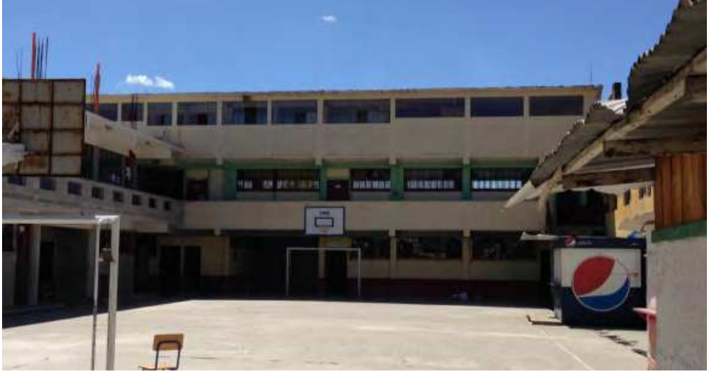
Figure 17 – Three-story confined masonry building