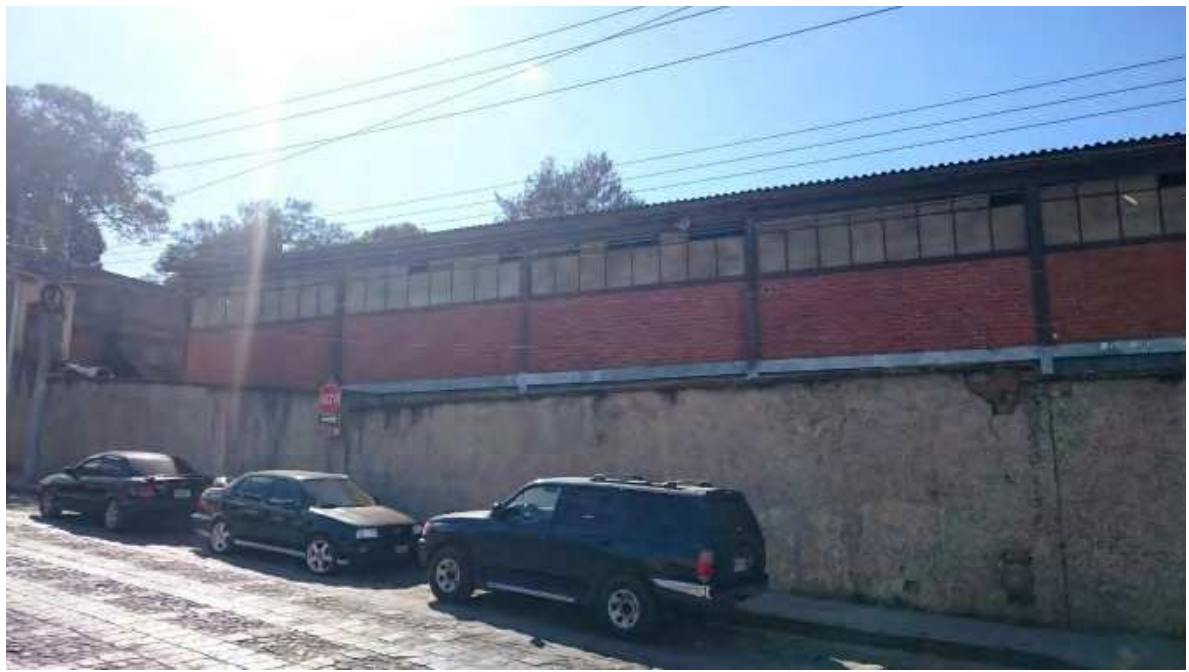
Figure 33 – Front elevation

This is a two-story confined masonry building (Figure 33). Access inside the school yard was not permitted during the visit and so observations were made from the exterior. The building has a lightweight roof. The site is sloping.