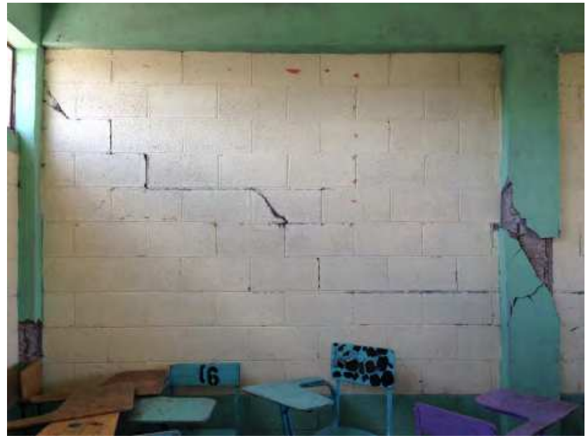
Figure 22 – In-plane shear failure (masonry and column)