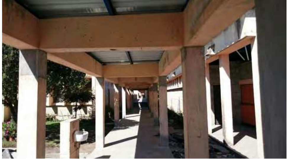
Figure 8 – Repaired concrete frame canopy structure