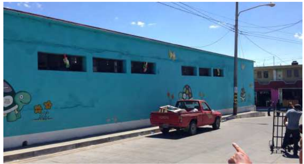
Figure 27 – Side of school along classroom wing (from exterior)