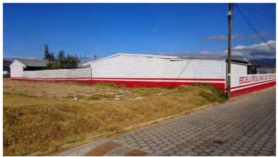
Figure 34 – Low-rise confined masonry school buildings.

This school had multiple one-story confined masonry buildings with light weight roofs (Figure 34). The masonry gable end walls were low-rise and typically had confining elements (Figure 35). The site was flat. The building was only observable from the exterior during the visit.