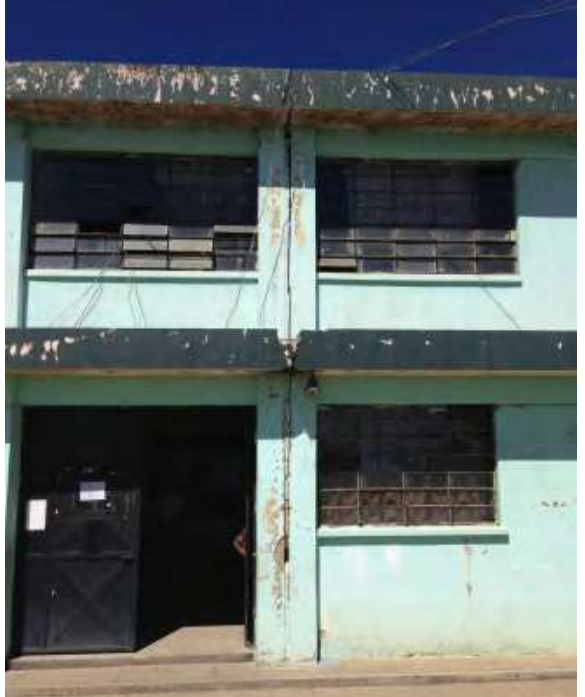
Figure 11 – Seismic joint between concrete frame buildings – mortar-covered & foam-filled