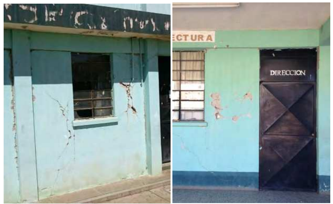
Figure 16 – Shear cracking of infill