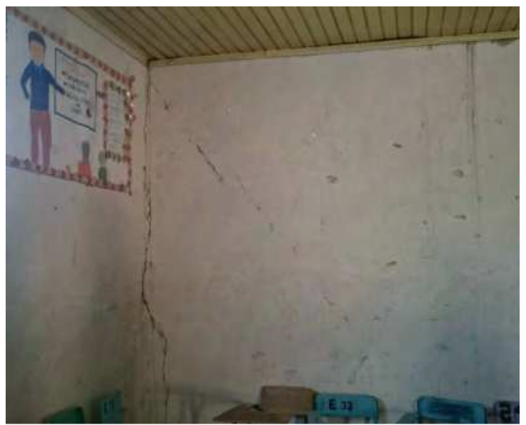
Figure 20 – In-place cracking of URM

The two-story building was constructed after the earthquake and therefore had no damage. The one-story structures had some in-plane (Figure 20) cracking and out-of-plane failures (Figure 21) of the unreinforced masonry walls. The three-story structure was more heavily damaged and only partially repaired. There was evidence of wall failures in shear (Figure 22), short column failures (Figure 23) (which had been repaired by adding a new column next to the failed column (Figure 24)), and residual out-of-plane wall movement (Figure 25).