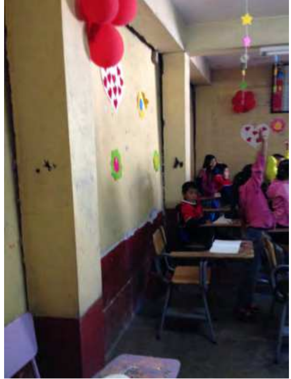
Figure 25 – Out-of-plane wall movement and separation from frame