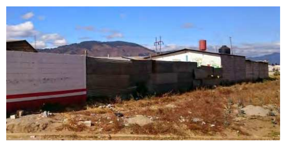
Figure 36 – Temporary perimeter wall

Portions of the cantilevered perimeter wall had collapsed and were replaced by metal sheeting (Figure 36). One building had suffered damage to the windows. The school infilled these windows with masonry in order to close the damaged windows and strengthen the building (Figure 37).