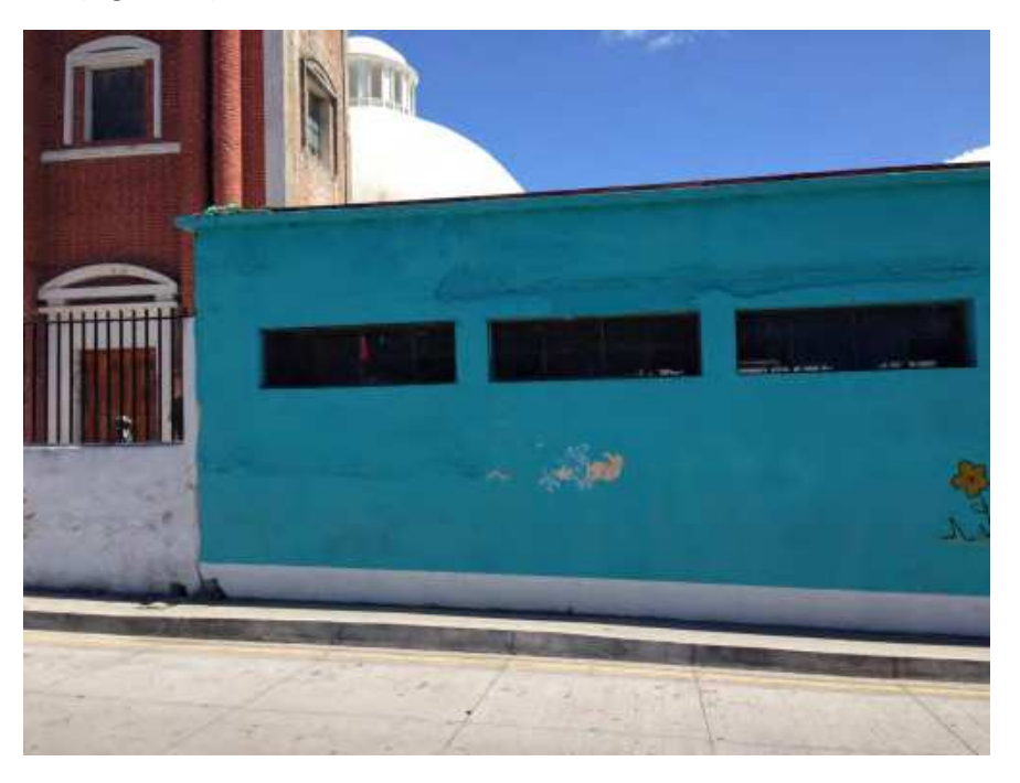
Figure 29 – Evidence of horizontal cracking at wall-roof intersection

There was evidence of prior cracking where the roof met the exterior wall (Figure 29), cracking at columns along the window sill level (Figure 30) – particularly on the courtyard side where there were few walls and mostly windows, cracking at the top of walls (Figure 31), and some shear cracking in walls (Figure 32).