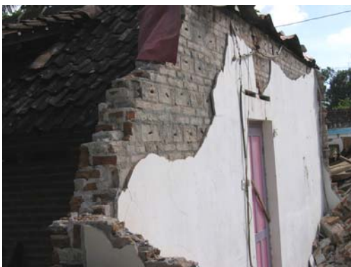
Figure 6. Unreinforced masonry. Sumbermilo (Bantul) IMG_6771

Wood-fired clay bricks were laid in sand-clay mortar or weak cement-sand-lime mortar. In many cases, the mortar would crumble under finger pressure. The walls of the oldest masonry houses were approximately 25 cm wide, built with full brick bonding (English bond). The bricks used in the oldest houses tended to be longer (25cm x 11cm x 4cm) than their modern counterparts (22 cm x 11cm x 4 cm). Full brick wide bonding is not possible with the shorter bricks, so common practice transitioned to a 17 cm wide bond in which two bricks were laid in the plane of the wall and one brick turned on its side (Fig. 6 and 7).