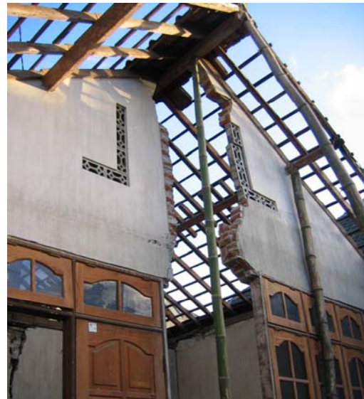
Figure 21. Collapse of offset gable, Kasongan, Kasihan (Bantul), S7.84512° E110.33534°, IMG_6824

(3) Absence of plinth beams and ring beams. Many newer houses had reinforced concrete columns but no reinforced concrete ring beams (Fig. 22 and 23).