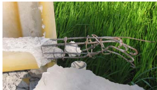
Figure 27. Reinforcement in beam for house/shop, Bebekan Mulyodadi, Bambang Lipuro (Bantul) S7.93460° E110.32194°, IMG_6781

(6) Foundation Issues. Foundations for both older and newer houses consisted of shallow strip footings built of random, angular mountain stone or brick masonry in mud or cement mortar. Only one foundation-related failure was found; masonry walls of a single story house shifted horizontally at the interface between the wall and the stone masonry foundation (Fig. 28).