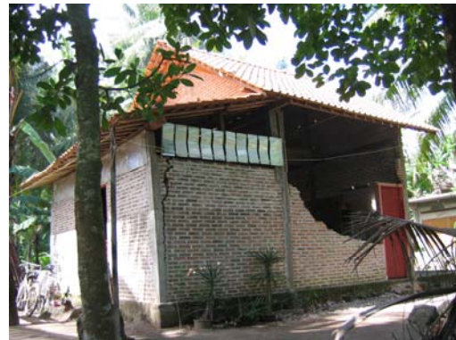
Figure 23. Collapse of masonry wall (note absence of ring beam), Kebutren, Pleret (Bantul) S7.86905° E110.40272°, IMG_6725