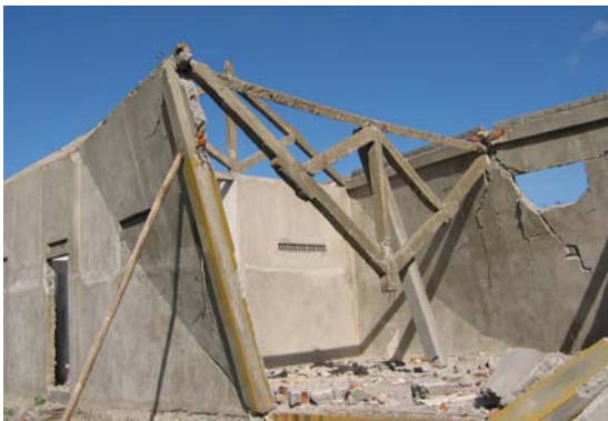
Figure 26. House/shop with reinforced concrete truss, Bebekan Mulyodadi, Bambang Lipuro (Bantul) S7.93460° E110.32194°, IMG_6778

(5) Use of reinforced concrete trusses. Reinforced concrete trusses were seen in a few of the houses, all of which had non-ductile failures at the beam-column connections (Fig. 26 and 27). These buildings were mixed use; the rear part was used for storage or living area, and the front for a shop. As a result, the front was typically an open frame (no shear wall).