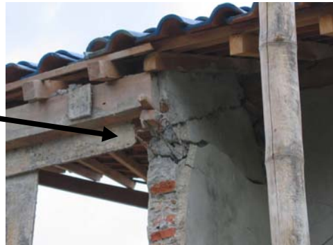
Figure 14. Zoom-in view of ring beam – column connection. IMG_6577