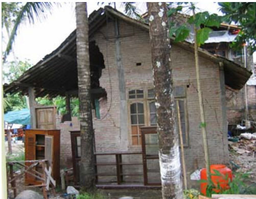
Figure 22. Collapse of masonry wall (note absence of ring beam), Pleret (Bantul) IMG_6589

(3) Absence of plinth beams and ring beams. Many newer houses had reinforced concrete columns but no reinforced concrete ring beams (Fig. 22 and 23).