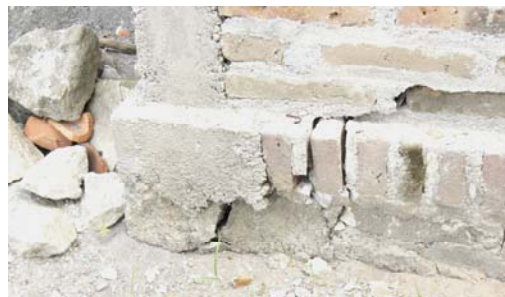
Figure 28. Sliding along wall/foundation interface, Tegal Kebong Agung, Imogiri (Bantul) S7.93434° E110.36667°, CIMG1769

(6) Foundation Issues. Foundations for both older and newer houses consisted of shallow strip footings built of random, angular mountain stone or brick masonry in mud or cement mortar. Only one foundation-related failure was found; masonry walls of a single story house shifted horizontally at the interface between the wall and the stone masonry foundation (Fig. 28).