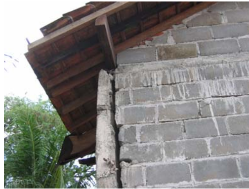
Figure 16. Insufficient connection between column and beam, Segoroyoso, Pleret (Bantul) S7.88174° E100.40869°, IMG_6749