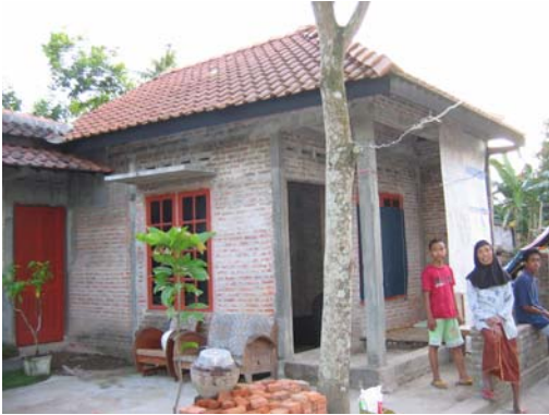
Figure 8. Well designed and built confined brick masonry house, edge of heavily damaged Pleret (Bantul), S7.83686° E110.41552°, IMG_6636

Confined or Partially Confined Masonry. Many newly built confined masonry houses with reinforced concrete tie columns and bond beams at the plinth and roof levels performed well in this earthquake. Examples of good performance of confined fired brick, solid concrete block, and stone masonry were scattered throughout the heavily affected areas (Figs. 8 through 10). Columns were typically cast after the masonry wall was built, flush with the wall, and thus the same width as a brick or block (10 or 11 cm). Smooth reinforcing steel was common, typically 6 or 8mm in diameter with stirrups ranging from 3 to 6mm in diameter. Stirrups were often spaced at 15 to 20 cm intervals.