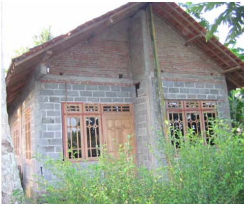
Figure 20. Minor damage to offset gable, Gantiwarno (Klaten), S7.75485° E110.53555°, IMG_6905