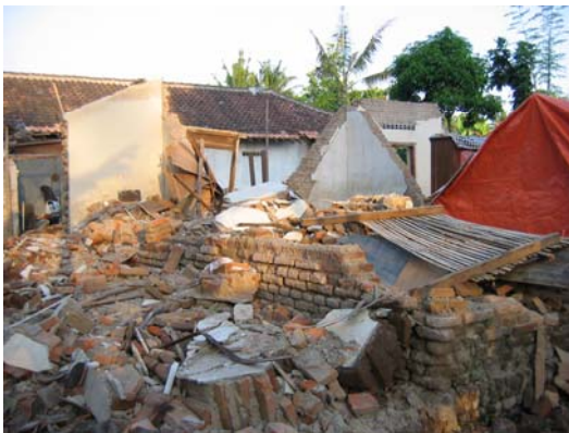
Figure 4. Destroyed unreinforced masonry houses, Pleret (Bantul), S7.83686° E110.41552° IMG_6633

Unreinforced Masonry. Unreinforced masonry houses were ubiquitous throughout the affected area and the most severely damaged (Fig. 4 and 5). No steel reinforced concrete foundation beams, columns, or ring beams were used in older houses.