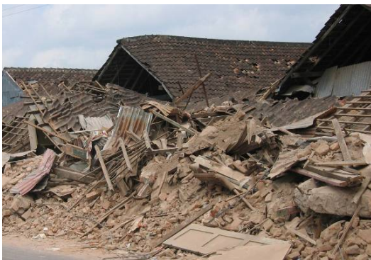
Figure 2. Debris along main street through Imogiri, S7.92282°, E110.38374° IMG_6551

The most heavily affected areas are Bantul district in Yogyakarta Special Province (DIY), in which 47,000 houses were destroyed, and Klaten district in Central Java Province, in which 66,000 houses were destroyed. CGI, 2006 estimates 4.1 million cubic m of debris exist in the affected region (Figs 2 and 3).