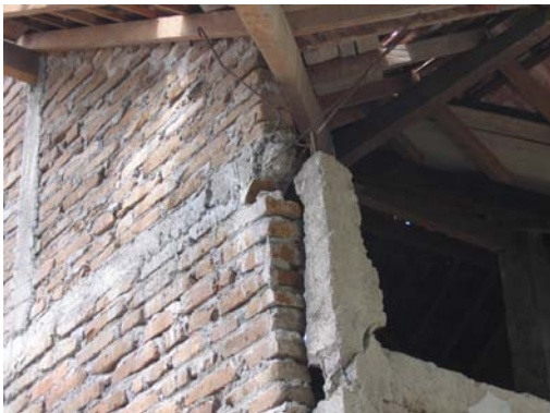
Figure 17. Insufficient connection between column and beam, Pleret (Bantul) S7.88174° E100.40869°, IMG_6746