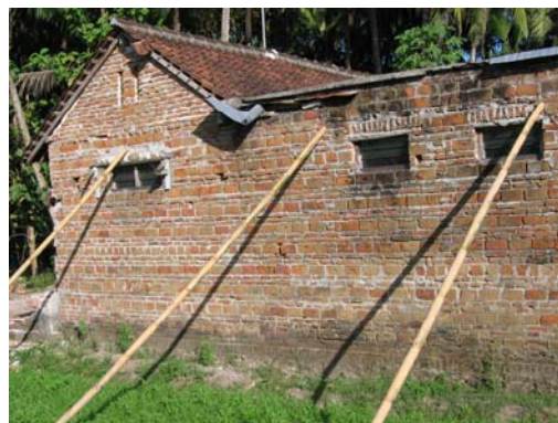
Figure 7. Unreinforced masonry, Bebekan Mulyodadi, Bambang Lipuro (Bantul). S7.94160°, E110.32297° IMG_6806