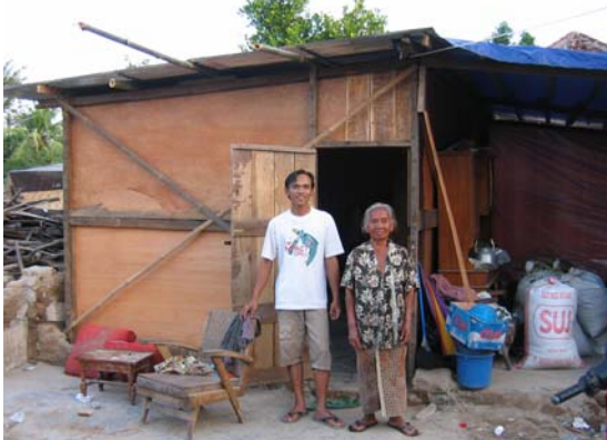
Figure 29. Transitional house in Pleret (Bantul), S7.83686° E110.41552°, IMG_6646

Tents were distributed in some areas, as were hammers, shovels and other tools to support debris clearing and recycling. Many families with destroyed houses have already rebuilt transitional one or two-room shelters on the foundation of their destroyed house (Fig. 29 and 30). Transitional shelters use a mix of recycled timber, bamboo, and window and door frames, and new plastic tarps, plywood and corrugated galvanized iron sheets. Also, many families were continuing to live in houses that were damaged beyond repair and vulnerable to collapse in aftershocks.