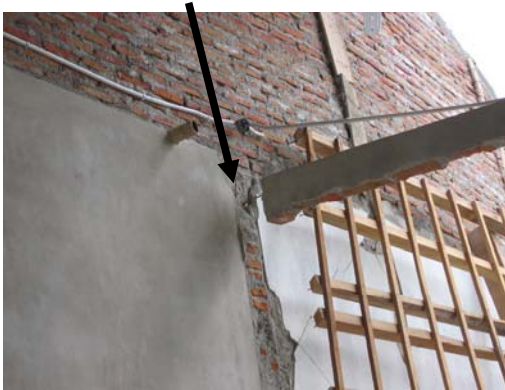
Figure 15. Zoom-in view of beam without connection, IMG_6579