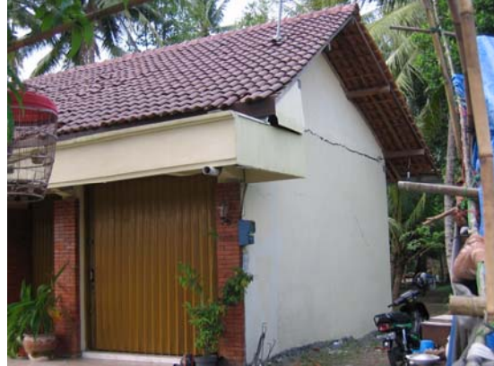
Figure 19. Masonry gable wall overturning (Bantul) S7.89468°, E110.37341°, IMG_6542