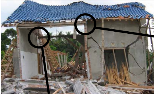
Figure 13. Confined masonry house under construction, insufficient connections, Pleret (Bantul). S7.87574°, E110.40703°, IMG_6575