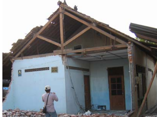
Figure 25. Typical timber truss with steel plates reinforcing the joints, Kasongan, Kasihan (Bantul), S7.84512° E110.33534° IMG_6831.

(5) Use of reinforced concrete trusses. Reinforced concrete trusses were seen in a few of the houses, all of which had non-ductile failures at the beam-column connections (Fig. 26 and 27). These buildings were mixed use; the rear part was used for storage or living area, and the front for a shop. As a result, the front was typically an open frame (no shear wall).