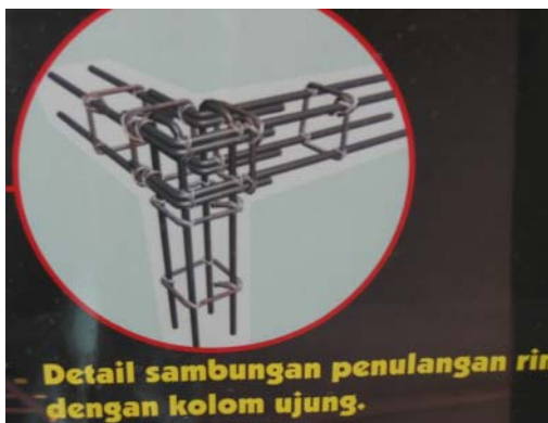
Figure 11. Beam column connection detailing in posters distributed by CEEDEDS, UII, IMG_6618

Prior to the earthquake, three houses were built in Wonokromo, Pleret (Bantul) under the supervision and direction of Prof. Sarwidi of the Center for Earthquake Engineering, Dynamic Effect, and Disaster Studies (CEEDEDS) at Universitas Islam Indonesia. These confined masonry houses used connection detailing shown in the posters distributed by CEEDEDS (Figure 11). The houses performed very well in the earthquake, with only hairline cracks, and in one case minor some damage to masonry gable wall (Figure 12).