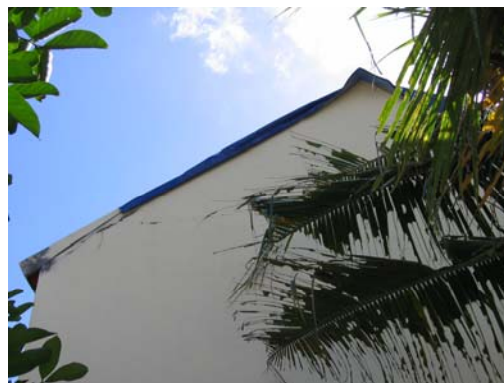
Figure 12. Crack at masonry gable, CEEDEDS house, Jejeran-2, Wonokromo, Pleret (Bantul), S7.86676° E110.38764°, IMG_6696