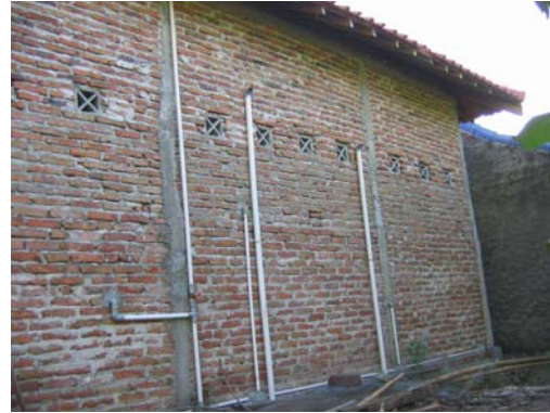
Figure 9. Backside of well designed and built confined brick masonry house, Bebekan Mulyodadi, Bambang Lipuro (Bantul), S7.94160°, E110.32297°, IMG_6804