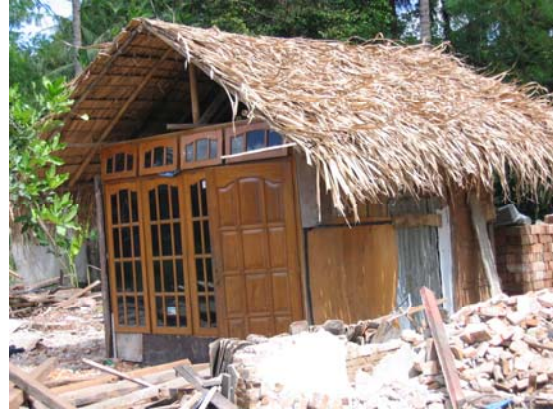
Figure 30. Transitional house in Pleret (Bantul) IMG_6727