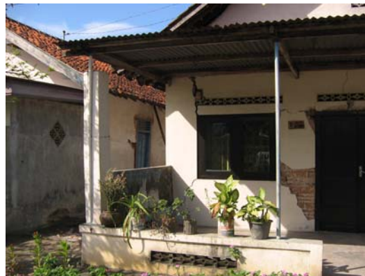
Figure 5. Unreinforced masonry house, damage category D3, Tlogo, Prambanan (Klaten), S7.75259° E110.49550° IMG_6852

Wood-fired clay bricks were laid in sand-clay mortar or weak cement-sand-lime mortar. In many cases, the mortar would crumble under finger pressure. The walls of the oldest masonry houses were approximately 25 cm wide, built with full brick bonding (English bond). The bricks used in the oldest houses tended to be longer (25cm x 11cm x 4cm) than their modern counterparts (22 cm x 11cm x 4 cm). Full brick wide bonding is not possible with the shorter bricks, so common practice transitioned to a 17 cm wide bond in which two bricks were laid in the plane of the wall and one brick turned on its side (Fig. 6 and 7).