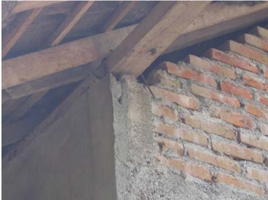
Figure 24. Common connection between column and beam – column steel wrapped around timber, Jejeran-1, Wonokromo, Pleret (Bantul), S7.86480° E110.38821° IMG_6672.

(4) Insufficient connections between walls or columns and roof. Column steel was often wrapped around a timber beam which functioned as a ring beam (Fig. 24). Timber beams were generally 8cm by 12cm and made from coconut trees or hardwood from Java and Kalimantan. Bamboo is also common for roof structures. Some older houses were a mix of structural system, in which part of the roof load was carried by timber posts infilled with masonry. A typical timber truss is shown in Fig. 25.