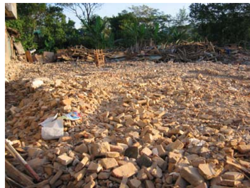
Figure 3. Debris in Gantiwarno (Klaten, Central Java). S7.76802 E110.54156 IMG_6916