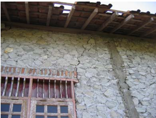
Figure 10. Partially confined stone masonry house with timber ring beam, Platar Somopuro, Jokonalan (Klaten), S7.75478, E110.53557, IMG_6897