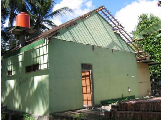
Figure 18. Masonry gable wall overturning, Keputren, Pleret (Bantul) S7.86905° E110.40272°, IMG_6721